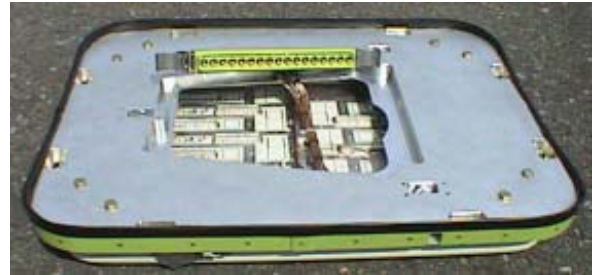
Antenna Head Unit

The antenna head unit is housed in a low profile enclosure that fits directly to the underside of the PILATUS PC-12, and has minimal impact on the aerodynamics of the airborne platform.