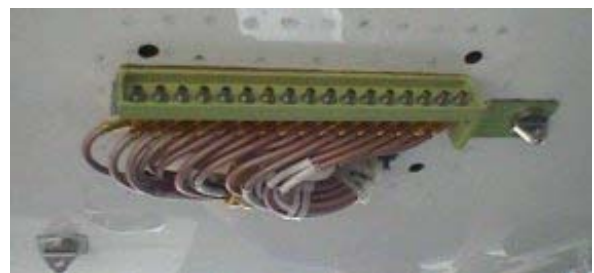
Quick disconnect panel on underside of PC-12

The AHU itself is detachable to enable easy implementation of product upgrades and maintenance, and safe storage when not in use.