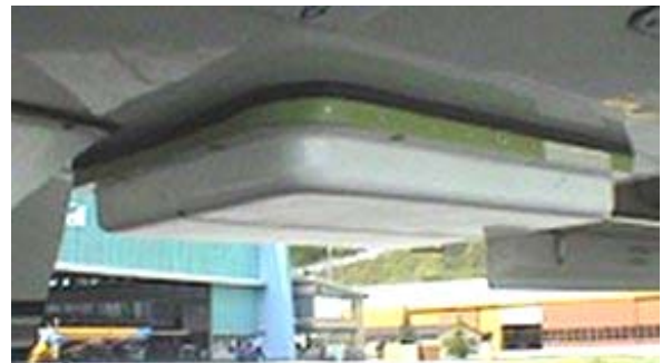
AHU attached to the underside of a PC-12

The antenna head unit is housed in a low profile enclosure that fits directly to the underside of the PILATUS PC-12, and has minimal impact on the aerodynamics of the airborne platform.