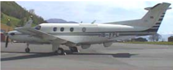
PILATUS PC-12 aircraft

SKYLINK is the unique video relay service provided jointly by QinetiQ and Lions Air, which allows transmission of live digital or analogue video to a ground receiver via a PILATUS PC-12 plane, flying at an altitude of up to 10km.